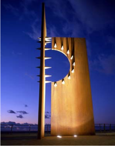
Desire by Chris Knight, 2001. Blackpool Promenade.