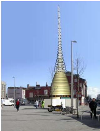
Silica by artists Wolfgang & Heron And structural engineers, Price Myers 3D Engineering

With the Council contracted to deliver 11 public realm schemes in five years, the work of artists was recognised as offering a significant contribution; the integration of art inspires, creates identity and makes public spaces more attractive and memorable.