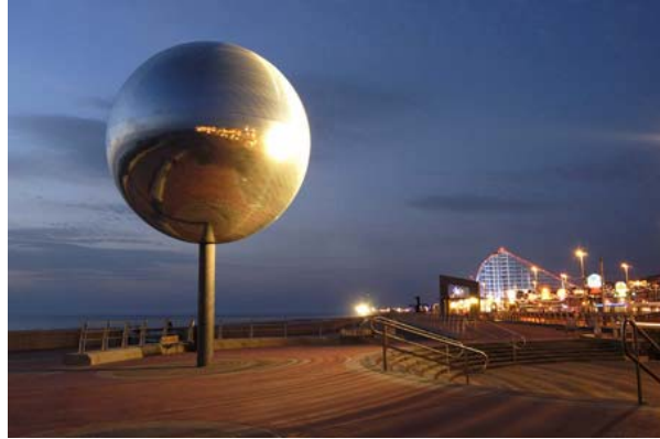
They Shoot Horses, Don't They? By Michael Trainor, 2002. Blackpool Promenade.