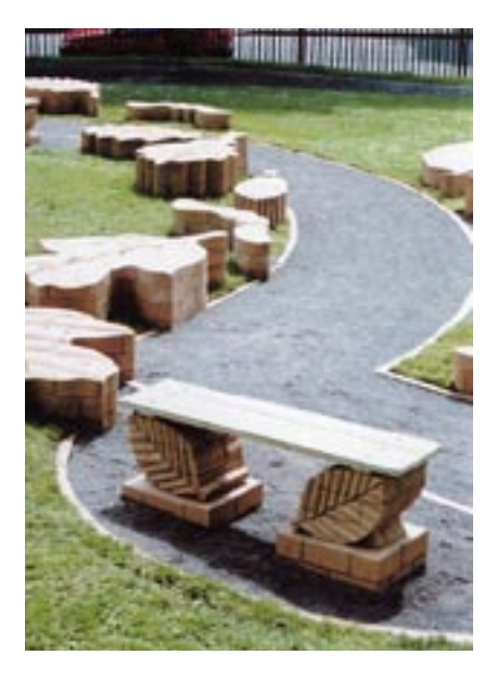
Image: David Mackie, Belle Vue Park, Penarth , Photo © courtesy of CBAT.