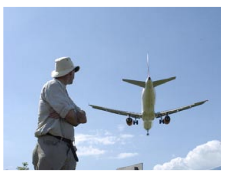
Image: Cardiff International Airport.

Stand alone / integrated / community based designs