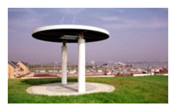
Image: Mac Adams, 'The Belvedere (solar pavilion), Penarth Marina, Photo: Kiran Ridley © courtesy of CBAT.

This Strategy and its supplementary documents aims not just at highlighting the opportunities for commissioning in the Vale and outline the principles and mechanisms for procurement, but it also hopes to inspire new and innovative approaches through the inclusion of examples of good practice drawn from a European and North American context.