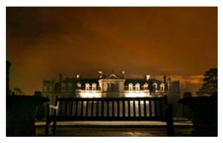
Image: Dyffryn House and Gardens.

Stand alone / Lighting Schemes / Installations