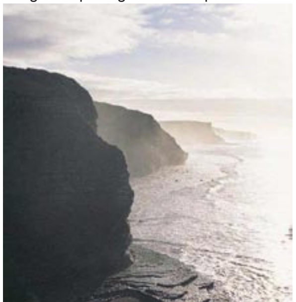
Image: The Glamorgan Heritage Coast.

Integrated paving trails / bespoke furniture / landscaping works