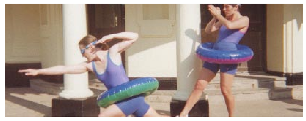
Image: 'The Promendaers', Penarth Pier re-opening event

The mechanism for implementing this policy for capital projects other than the Council's own is inevitably the planning process, where contributions can be secured through Section 106 Agreements and conditions for the provision of Public Art included in Planning Approvals. A Supplementary Planning Guidance document has been produced as part of this commission.