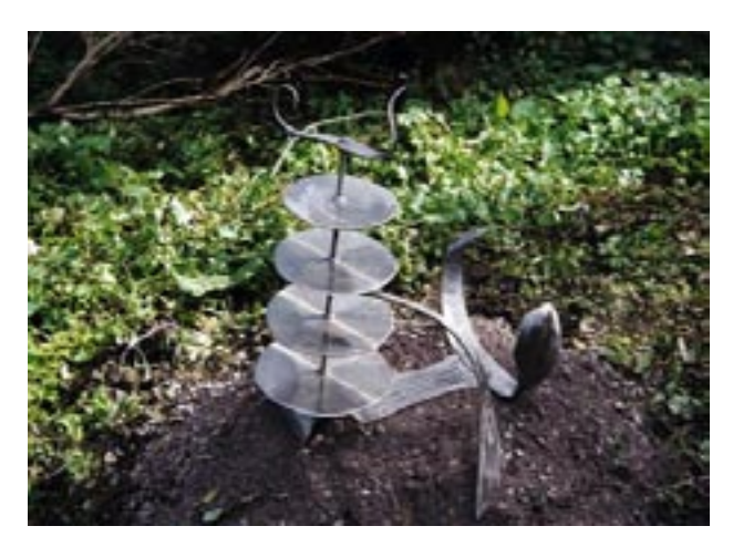
Image: 'Keltia', 2004, Steve Hubback, Coed Hills.

Stand alone / Integrated / Environmental