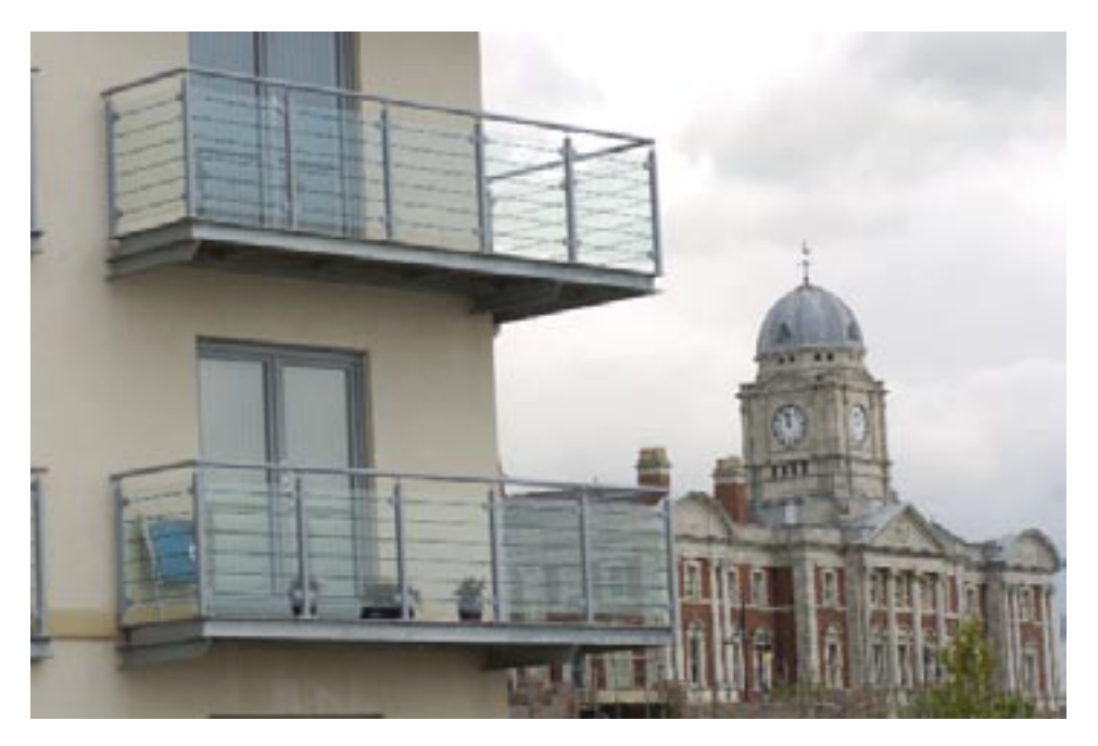
Image: Barry Waterfront Development.

The final strategy should be published and adequately promoted through a variety of general and specialist platforms, including the web sites of the local authority and other public bodies. It is also important that the strategy be communicated clearly and simply to the commercial development sector.