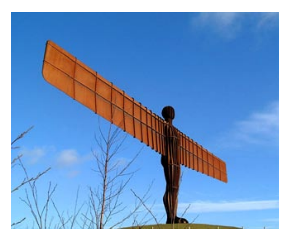
Image: Angel of the North, Antony Gormley.

Opportunities in Barry and the Waterfront are covered in the separate Barry Practice Guide.