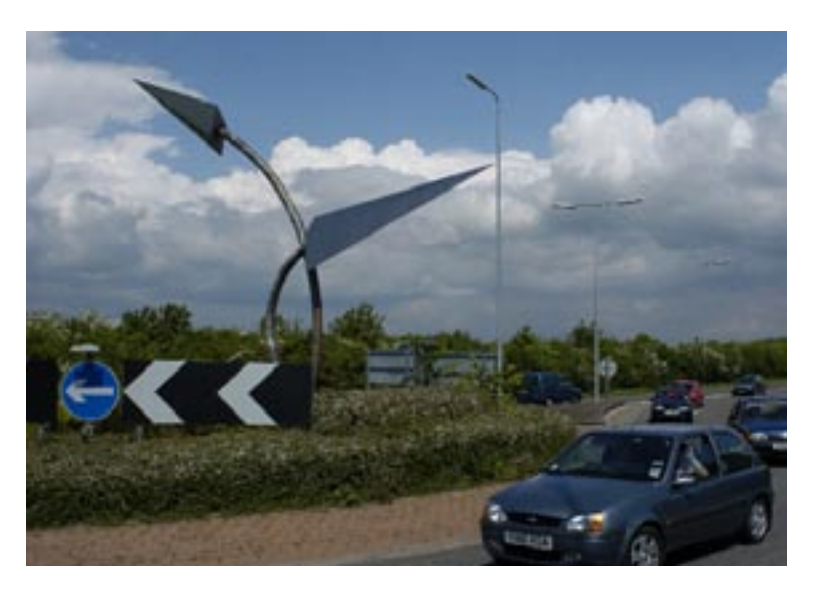
Image: Sculpture, \ Cardiff\ International\ Airport,\ Photo:\ Betina\ Skovbro\ \circledcirc\ courtesy\ of\ CBAT.